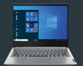
ThinkBook Series ThinkBook Plus, 13s