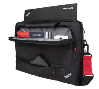
ThinkPad Essential Topload case