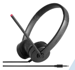
Lenovo Pro Stereo Wired VOIP