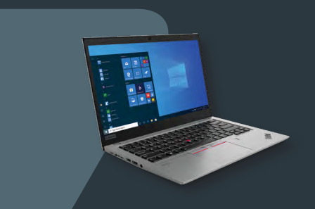
ThinkPad L Series ThinkPad L13, L13 Yoga, L14, L15