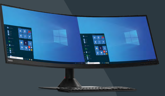
Lenovo™ ThinkVision® X and P Series