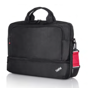
ThinkPad Essential Topload