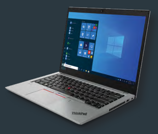
ThinkPad T Series ThinkPad T14, T14s, T15