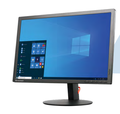
Lenovo Privacy Filter