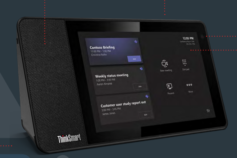
8" HD IPS touchscreen